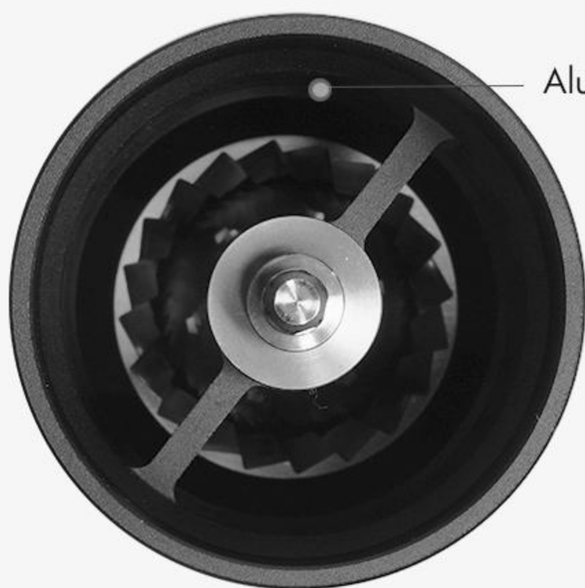
Aluminum Alloy Support

Solid Aluminum Alloy supports to fix dual bearings Two precise bearings to fix center shaft to make sure high concentricity and high constancy